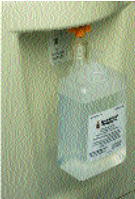
Humidifier cavity accepts the most difficult bottle sizes.