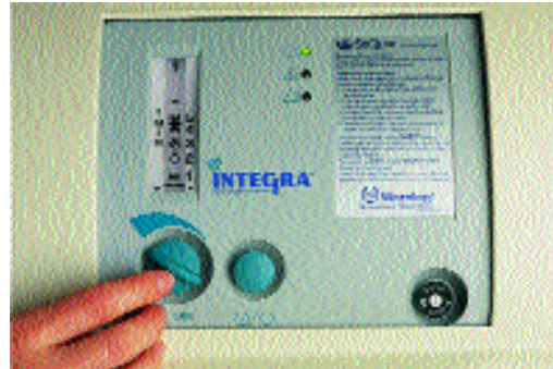
Simplified controls give users confidence and eliminate routine questions.