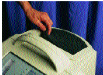
A "zero-clearance" air intake located atop the Integra™ prevents overheating if the unit is pushed against walls or draperies.